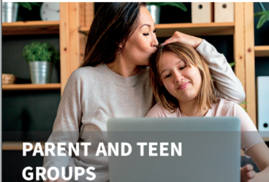
PARENT AND TEEN GROUPS