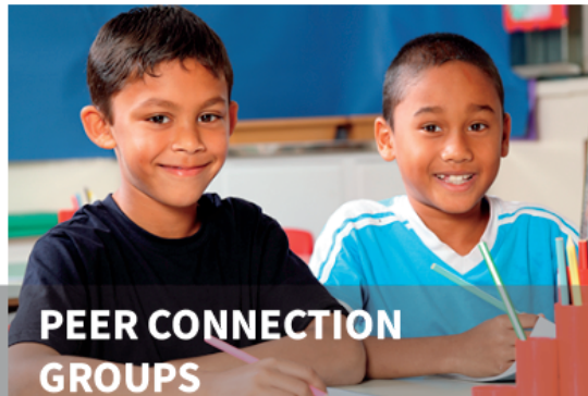
PEER CONNECTION GROUPS